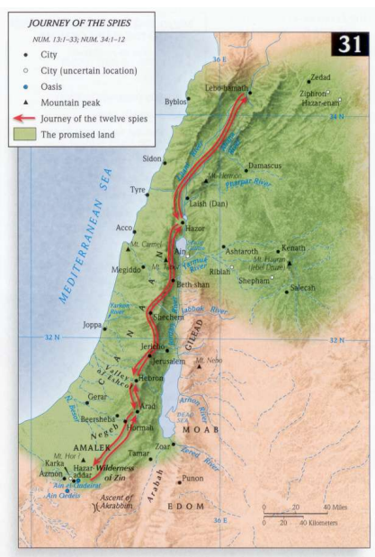
JOURNEY OF SPIES - Click to enlarge Holman Bible Atlas (digital book; Hardcover) One of best resources for Bible maps Please do not reproduce map on another webpage.

Numbers 13:21-23+ So they went up and spied out the land from the wilderness of Zin as far as Rehob , at Lebo-hamath. 22 When they had gone up into the Negev, they came to Hebron where Ahiman, Sheshai and Talmai, the descendants of Anak were. (Now Hebron was built seven years before Zoan in Egypt.) 23 Then they came to the valley of Eshcol and from there cut down a branch with a single cluster of grapes; and they carried it on a pole between two men, with some of the pomegranates and the figs.