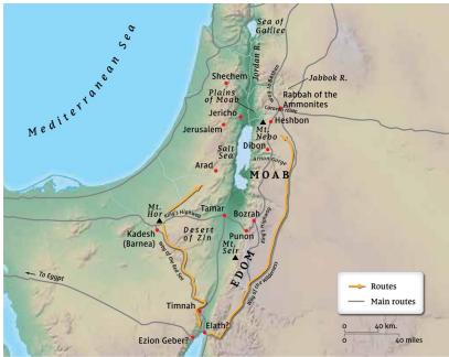
Route of Israel from Gulf of Aqabah to East of Jordan