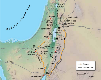
Route of Israel from Gulf of Aqabah to East of Jordan