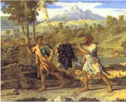
Carrying Cluster of Grapes