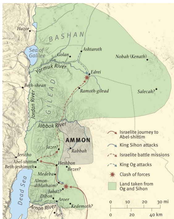
Israel Defeats Og and Sihon (ESV Study Bible) (Click to Enlarge)